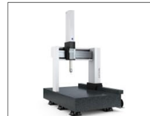
3D-High-precision CMM ZEISS ACCURA II X/Y/Z 1200/1800/1000

Our passion for technology is the fuel which drives us forward!