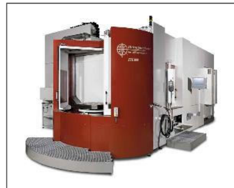
5-axis-milling Starrag STC800 X/Y/Z 1450/1200/1300mm