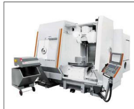
5-axis-milling Mikron HPM1150 U X/Y/Z 1000/1150/895mm