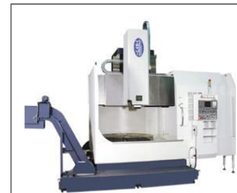
cnc turning YouJi YV-1200ATC DIA 1350x1200mm