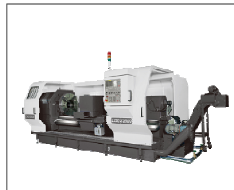
cnc turning Takang(Taiwan) LC40x1200 DIA 1020x1200mm