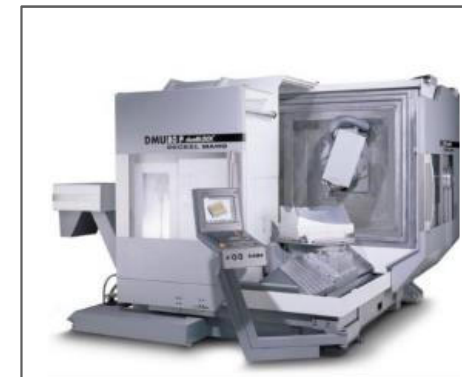
5-axis-milling Gildemeister DMU80P X/Y/Z 800/800/800mm